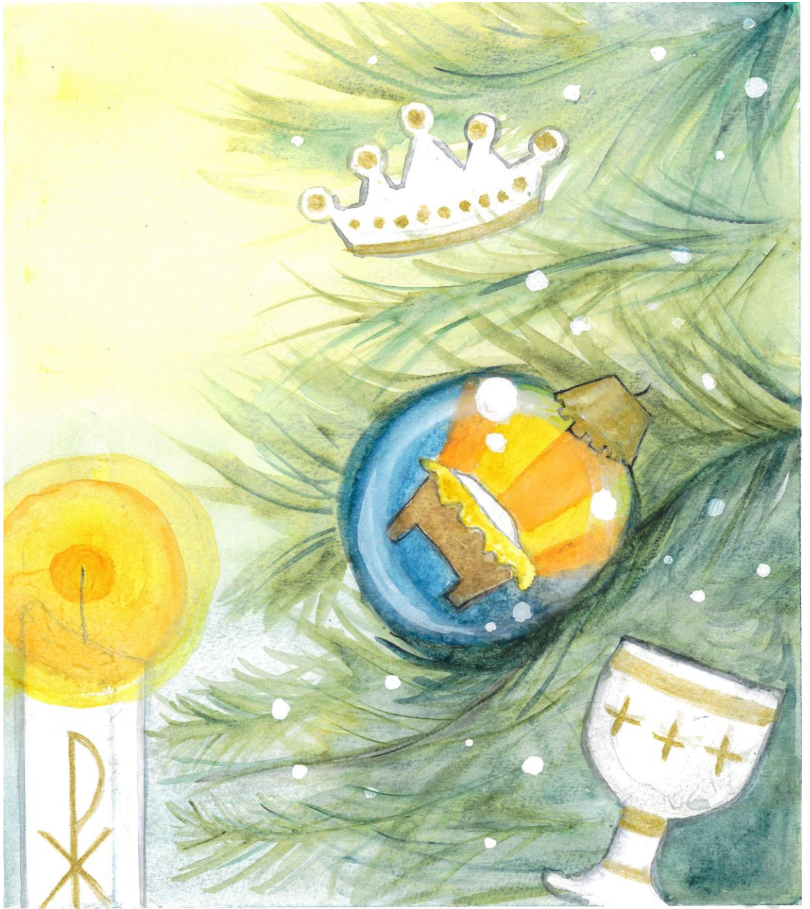
Lutheran Church of the Resurrection | Sunset Hills, MD